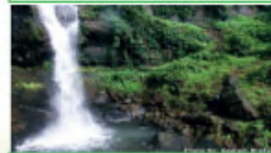
Neral Tapalwadi Waterfall