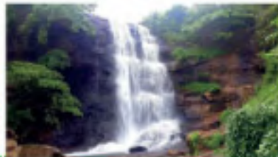
Anandwadi Waterfall (Matheran)