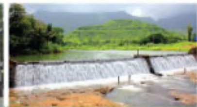
Ganesh Ghat & Matheran Hills