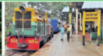
Matheran Toy Train-queen Of Sahyadri Hills