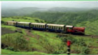
Neral to Matheran