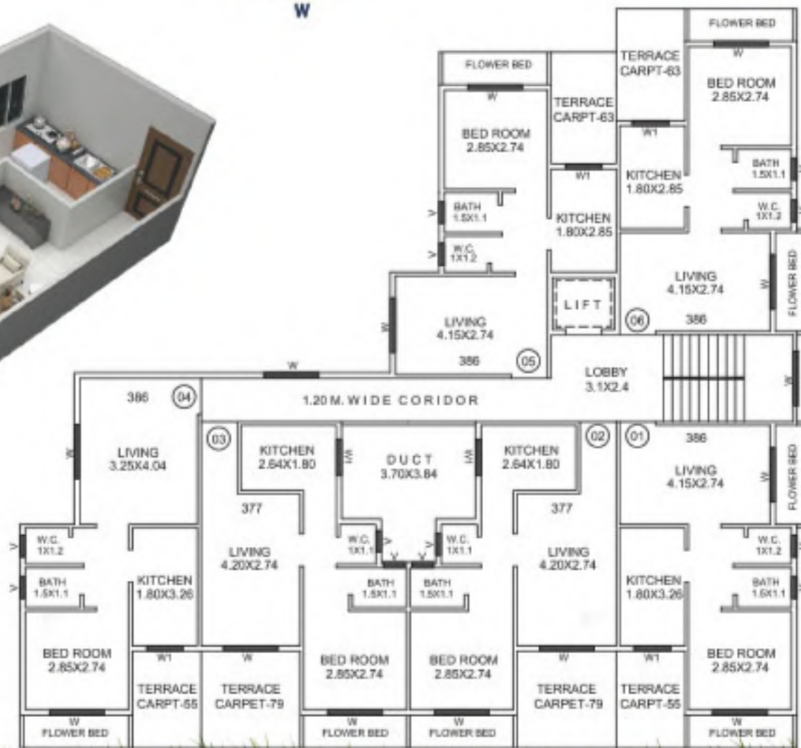
First & Third Floor Plan