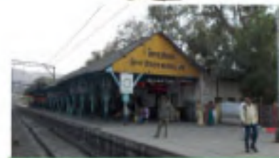
Neral Railway Station